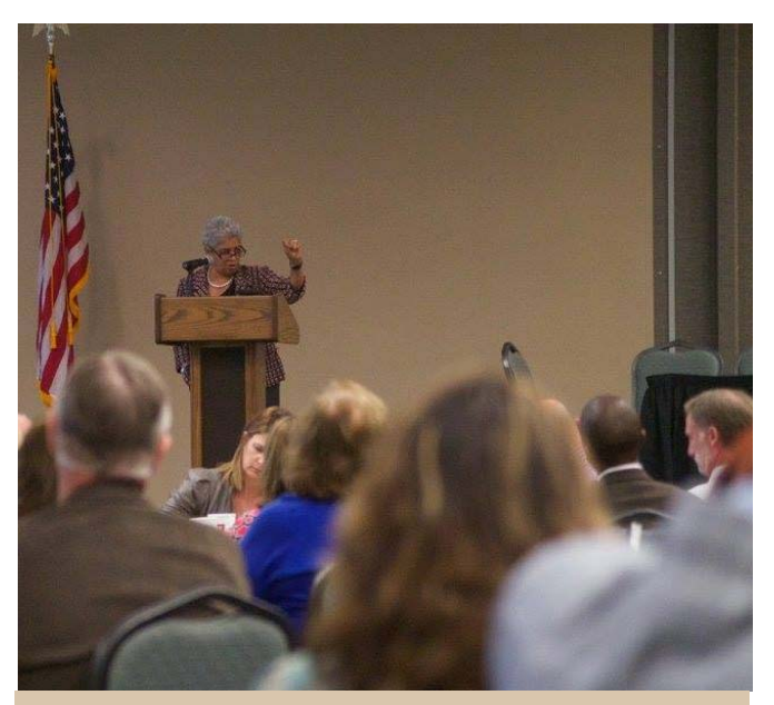
Former Atlanta Mayor Shirley Franklin challenges summit participants to, "Be honest, be authentic, follow the research and data, use rigorous evaluation, but most importantly, build relationships with the people you serve."

Summit participants came together to consider how they can work together, across issues and political jurisdictions to leverage resources and foster an economically inclusive future for all residents.