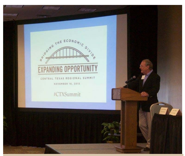
Bastrop Mayor Ken Kesselus welcomes 220 business and community leaders, policy makers, educators and service providers to the Expanding Opportunity Regional Summit at the Bastrop Convention Center on November 18, 2015.