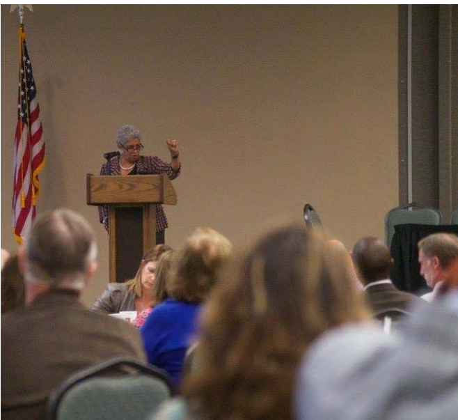
Former Atlanta Mayor Shirley Franklin challenges summit participants to, “Be honest, be authentic, follow the research and data, use rigorous evaluation, but most importantly, build relationships with the people you serve.”