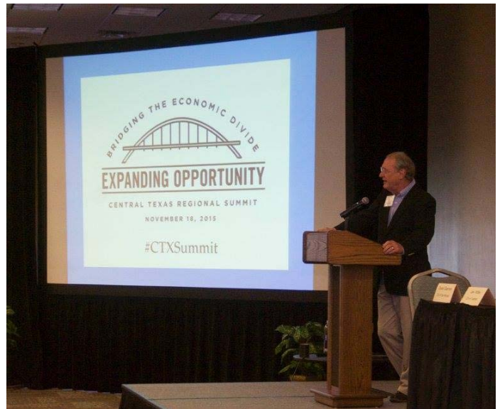
Bastrop Mayor Ken Kesselus welcomes 220 business and community leaders, policy makers, educators and service providers to the Expanding Opportunity Regional Summit at the Bastrop Convention Center on November 18, 2015.

Summit participants came together to consider how they can work together, across issues and political jurisdictions to leverage resources and foster an economically inclusive future for all residents.